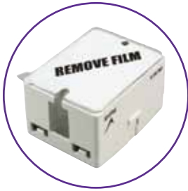
Thermal Pad (SSR-TP-1) Section 3 p.21