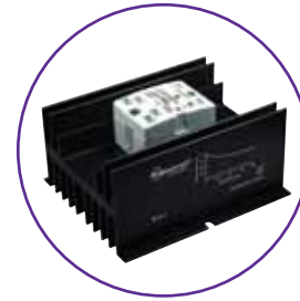
Heat Sink (SSR-HS-1) Section 3 p.20